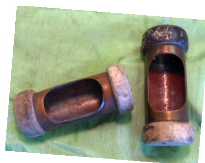
Items from Swinton's Stores - L to R: 1868 stock book; mid-C20th customer accounts book; brass money transfer cylinders.

Among the Swinton artefacts were the two brass canisters (above), part of the cash transfer system which operated in that department store. This adds to the W&DHS collection of such items. We also have examples of these from the Youngers and Cramond & Dickson stores. Each shop had a different Heath Robinsonesque contraption for conveying cash from point of sale to the stores' accounts departments, involving ropes, pulleys, wire baskets and metal tubes.